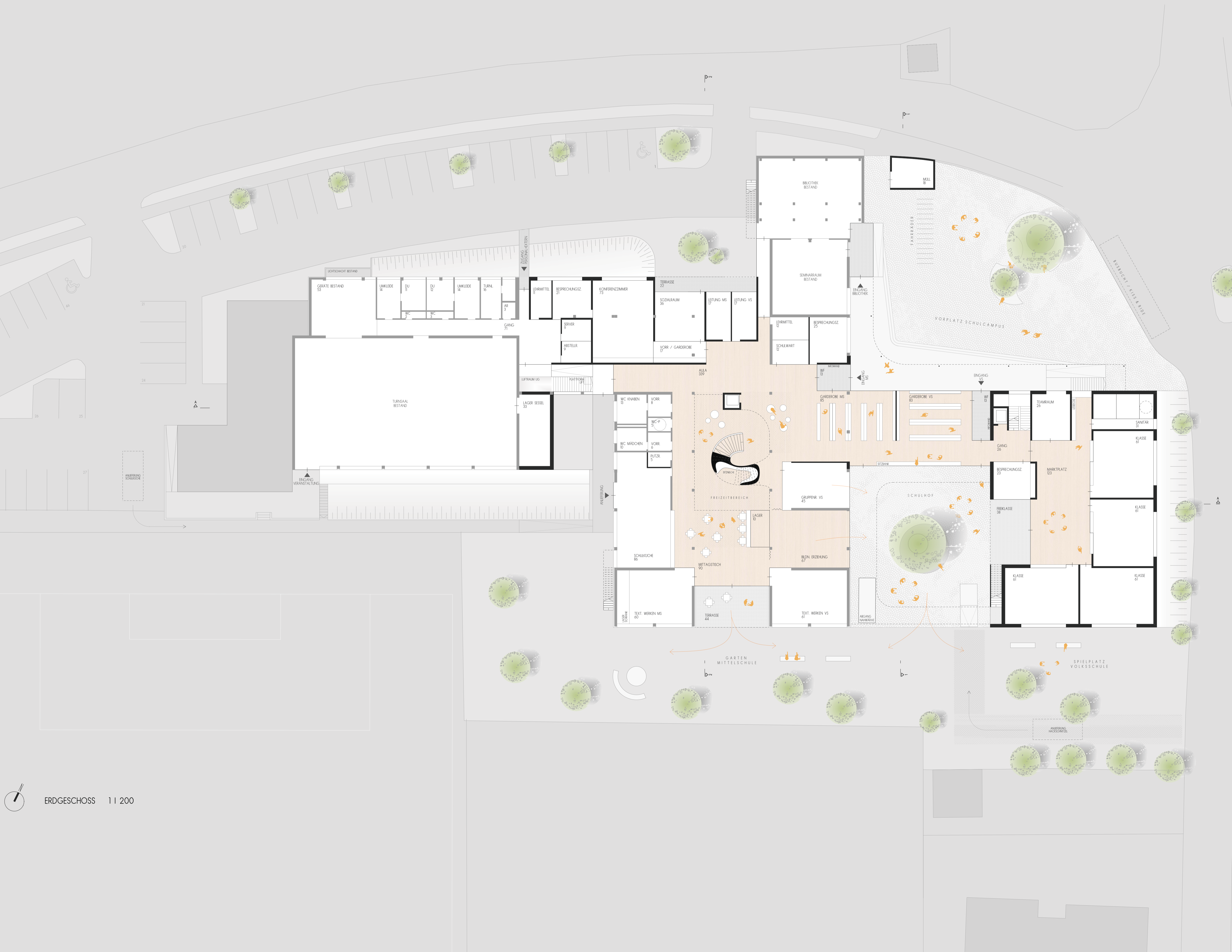
ERDGESCHOSS 1 | 200