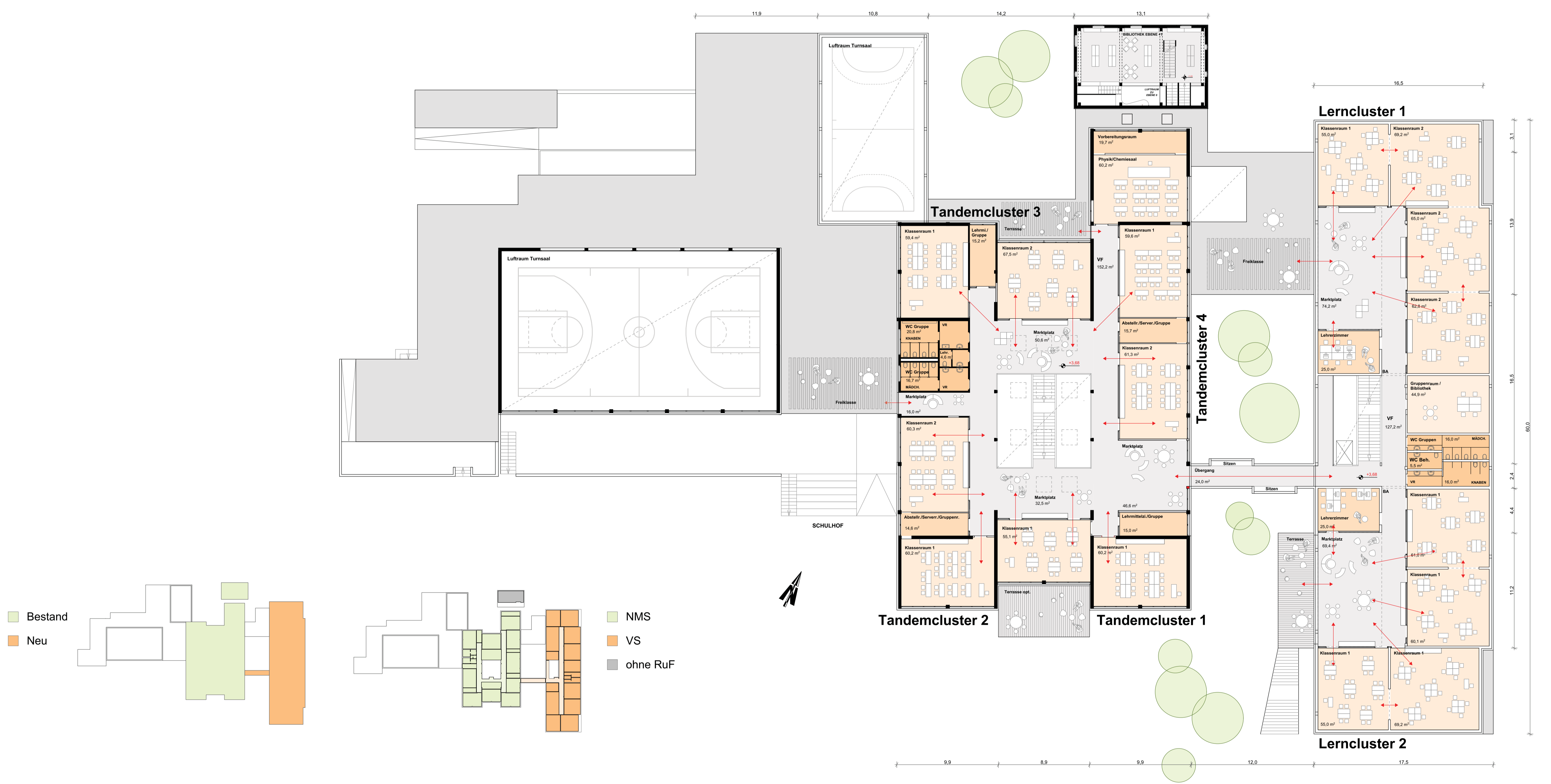
Bestand / Neubau